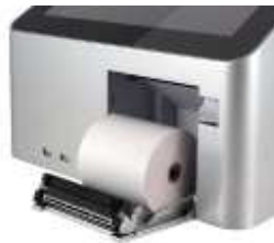
Easy loading thermal printer