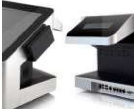
12.1" true flat touch monitor