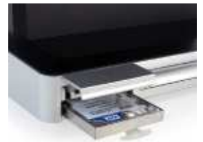
Slide-in hard disk for easy service