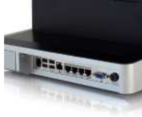
Versatile I/O ports